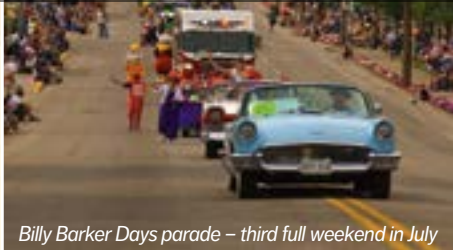
Billy Barker Days parade – third full weekend in July